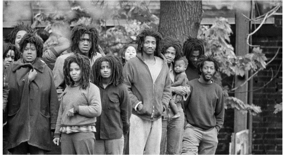
MOVE family, May 4, 1978.