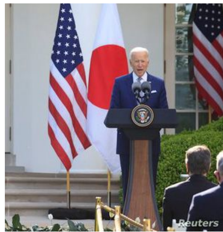
President Joe Biden held a joint news conference with Japan's Prime Minister Yoshihide Suga and at the White House, April 16.

The statement continues: "Each Party recognizes that an armed at-