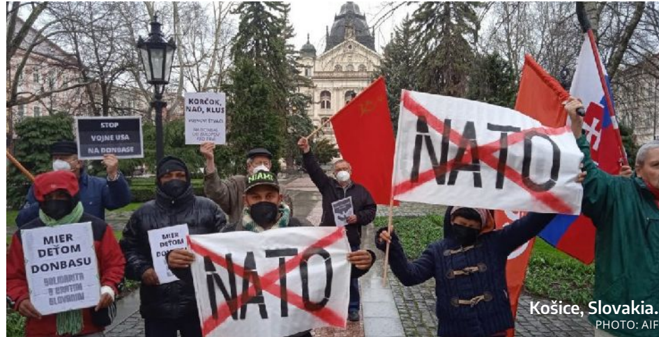
Košice, Slovakia.

the U.S. war in Donbass" and "We don't need NATO bases in Slovakia." A hand-drawn poster made by students at a local primary school said, "Peace to the children of Donbass."