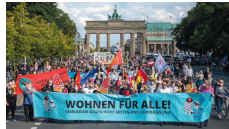
At a protest against high rents in Berlin, demonstrators hold a banner with the inscription 'Wohnen fuer Alle!' (Housing for All) on September 11, 2021.

result of an organized capitalist assault on working-class Berliners, who had overwhelmingly supported the rent cap. Renters were enraged, as they say their rents jacked up during the pandemic.