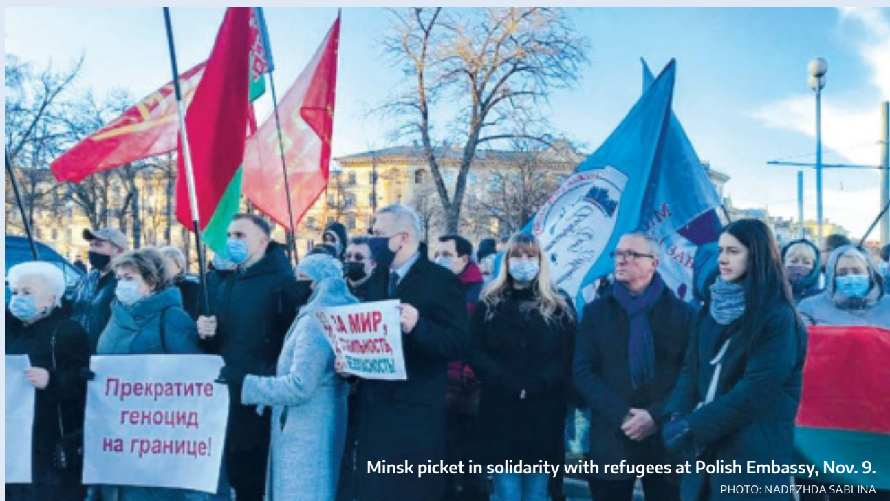
Minsk picket in solidarity with refugees at Polish Embassy, Nov. 9.

To sign the statement, email refugeesolidarityvs nato [at] gmail [dot] com