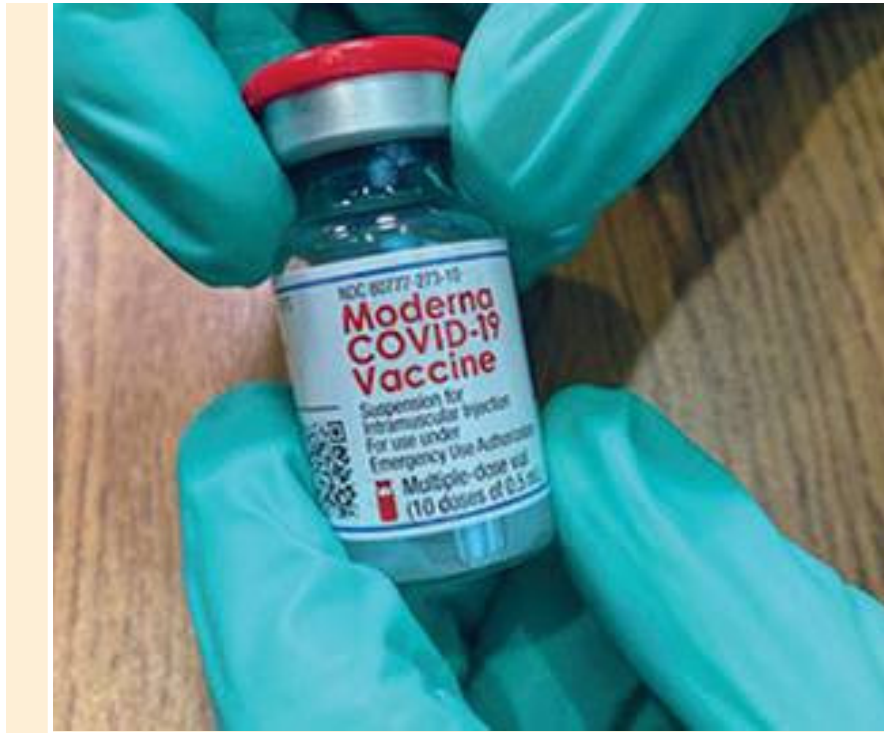
The collective wealth of Moderna's three top shareholders — Noubar Afeyan, Robert Langer and Timothy Springer — ballooned to $12.7 billion because of vaccine sales.

That's typical behavior for the big drug outfits known as Big Pharma. Every minute BioNTech, Moderna and Pfizer are together collecting $65,000 in profits from their