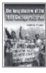
The long shadow of the 1919 Chicago race riot Stephen Millies

STRUGGLE ★ LA LUCHA for Socialism | por el Socialismo